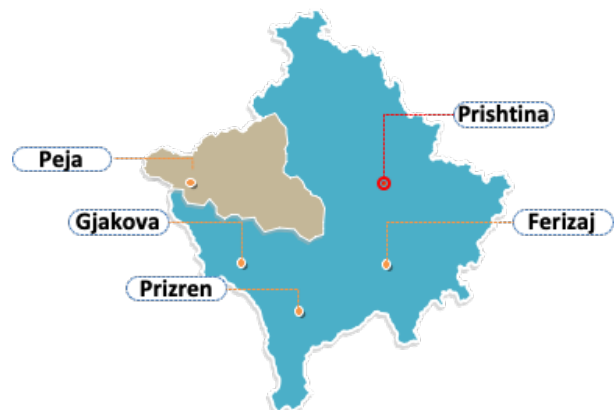
Figure 1. Map showing the region of Peja, Kosovo

In total, 160 milk samples were collected, 40 samples were ultra-high treated (UHT) milk, from which 7 samples were from well-known local producers in Kosovo, and 33 samples were from different producers from abroad countries which were obtained from big food suppliers. Each sample represents a different product of different producer with different time of production. UHT milk samples were taken one day before the analysis. The rest, 120, were raw bulk tank milk samples of local farmers in the region of Peja (Figure 1), each 40 samples were of three different seasons, summer 2021, winter 2021, and spring 2022, respectively. Raw milk samples were stored at - 20 °C until the time of analyses. Sampling was done according to the European Commission 401/2006 [6].